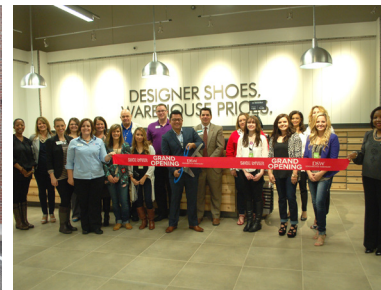
DSW SHOE WAREHOUSE 2203 Promenade Blvd., Ste. 20430, Rogers