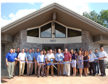
ENGLANDERDZP - NORTHWEST ARKANSAS 3607 S.E. Metro Pkwy., Bentonville