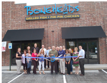
BONEHEADS 1403 S.E. Moberly Ln., Bentonville