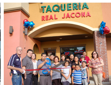
TAQUERIA REAL JACONA 1713 S. 8th St., Rogers