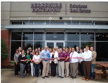
BERKSHIRE HATHAWAY HOMESERVICES SOLUTIONS REAL ESTATE 2905 S. Walton Blvd., Ste. 29, Bentonville