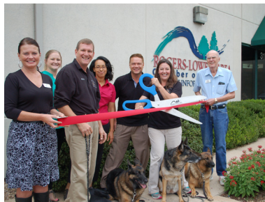
BED BUGS UNCOVERED LLC Carl Junction, MO