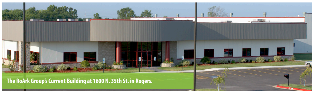
The RoArk Group's Current Building at 1600 N. 35th St. in Rogers.

RoArk determined many years ago that in order to be successful, it would be necessary to