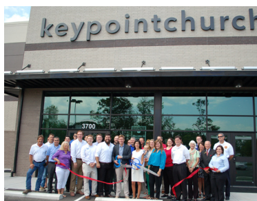
KEYPOINT CHURCH 3700 Medical Center Pkwy., Bentonville