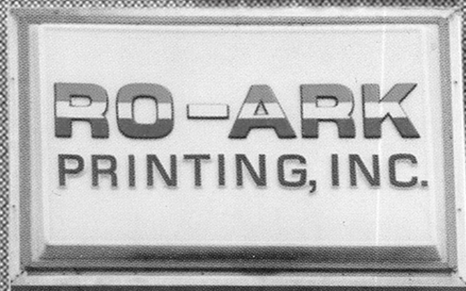
RoArk's First Commercial Building in Rogers

After much thought, the RoArk management team decided that one way they wanted to celebrate their 40th Anniversary was to recognize the employee teams who helped reach this milestone. This summer, one day was spent off-site for all RoArk employees to celebrate with team-building exercises, tasty food, and good old fashioned games. It concluded with a few extra hours given at the end of the day to spend with their family in appreciation of the day.