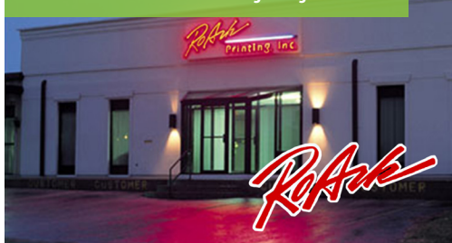
RoArk's Second Commercial Building in Rogers

Over the past 40 years, RoArk has seen enormous changes in the way commercial printing is produced. Printing was once a very hands-on and extraordinarily time-consuming craft. While printing still requires a certain amount of hands-on work, like many things in today's business environment, changing technology plays a big part in how commercial printing is produced today. With the advent of direct-to-plate technology, digital presses, wide format capabilities, and automated equipment, many of today's printing needs can be produced nearly on demand. In fact, an order for 500 small booklets can be input into the system one day, and printed, folded, stitched, packaged and in the customer's hands by the next afternoon.