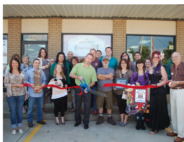
EMPORIUM 23 1320 W. Walnut St., Rogers