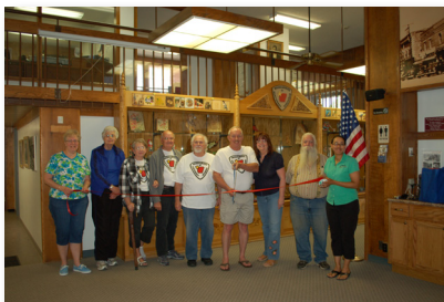
WOODCARVERS OF NORTHWEST ARKANSAS 201 S. 37th St., Rogers