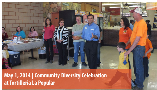
May 1, 2014 | Community Diversity Celebration at Tortilleria La Popular