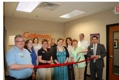
GATEWAY MORTGAGE GROUP 5506 Walsh Ln., Ste. 112, Rogers