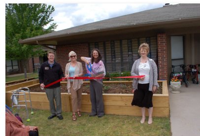
INNISFREE SENIOR LIVING COMMUNITY 300 Innisfree Cir., Rogers