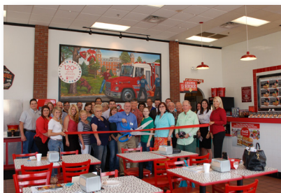
BLUE 15 MARKETING Bentonville