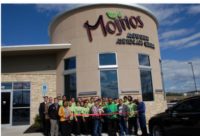
MOJITOS MODERN MEXICAN GRILL 2003 Promenade Blvd., Ste. 102, Rogers