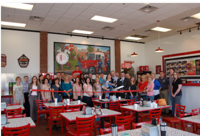
PHILLIPS-ROBERTS INSURANCE Fayetteville