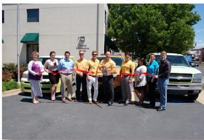
CERTAPRO PAINTERS OF NORTHWEST ARKANSAS 609 S. W. 8th St., Suite 600, Bentonville