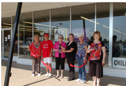
NORTHWEST ARKANSAS WOMEN'S SHELTER, THRIFT STORE 1622 S. 8th St., Rogers