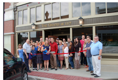
THE GRAND AT 117 117 W. Walnut St., Rogers